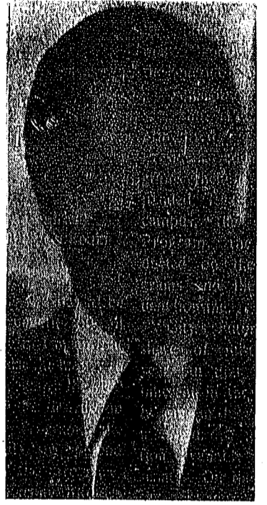
Ambassador Andrew Young.